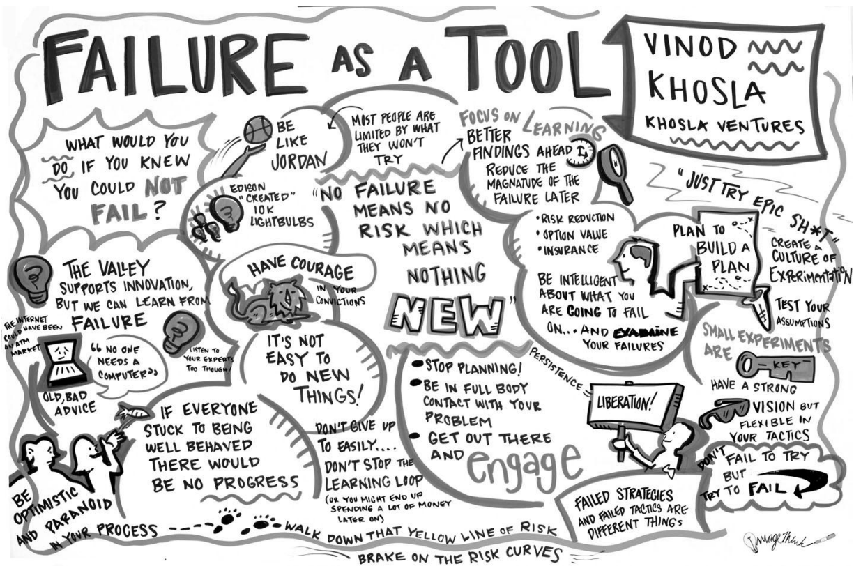
(Vinod Khosla, founder of Sun Microsystems, http://www.virgin.com/richard-branson/failure-as-a-tool )